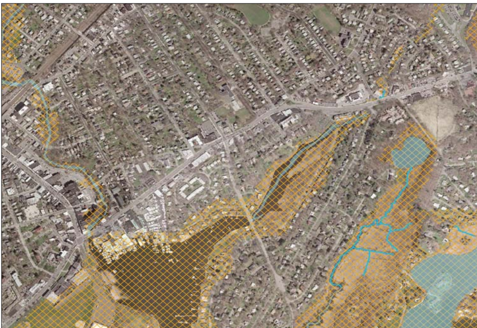
This version of the newly released FEMA digital flood insurance rate maps highlights areas surrounding the Mamaroneck Village Marina in the Village of Mamaroneck. The cross hatch pattern represents special flood hazard areas subject to inundation by the 1% annual chance of flooding.